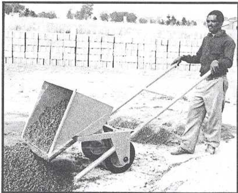
Does not tire the operator