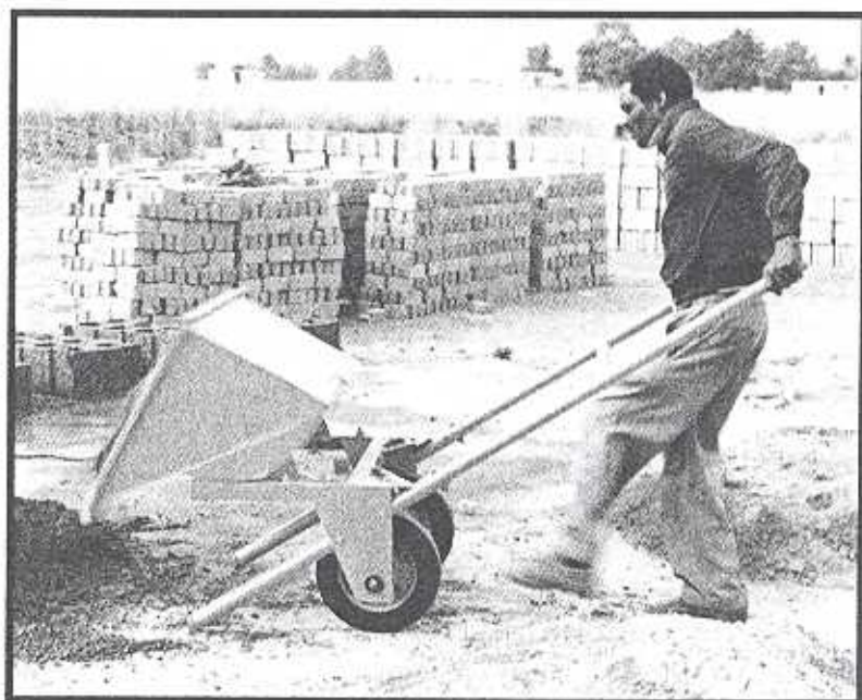
Simple foot release tips the barrow